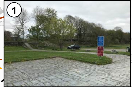
1 VIEW FROM CAR PARK ADJACENT BALA WATERSPORTS AND ADVENTURE CENTRE

NOTE: 1. ENTIRE AREA WITHIN BALA AND BALA LAKES REGISTERED LANDSCAPE OF SPECIAL HISTORIC INTEREST. 2. GWYNEDD COUNCIL LCA12: LANDERFEL AND BALA HINTERLAND SPECIAL LANDSCAPE AREA COVERS THE SAME AREA AS Mynydd Hiraethog/Denbigh Moors and Dyffryn Dyfrdwy a Llangollen/Llangollen and the Vale of Dee National Landscape Character Areas. SEE: 'SUPPLEMENTARY PLANNING GUIDANCE: LANDSCAPE CHARACTER, GWYNEDD COUNCIL, 2009'.