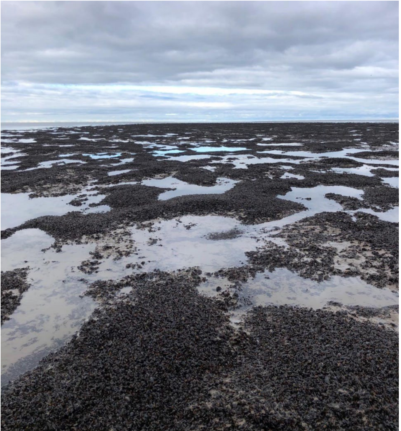
Figure 2. Ground laid mussels.